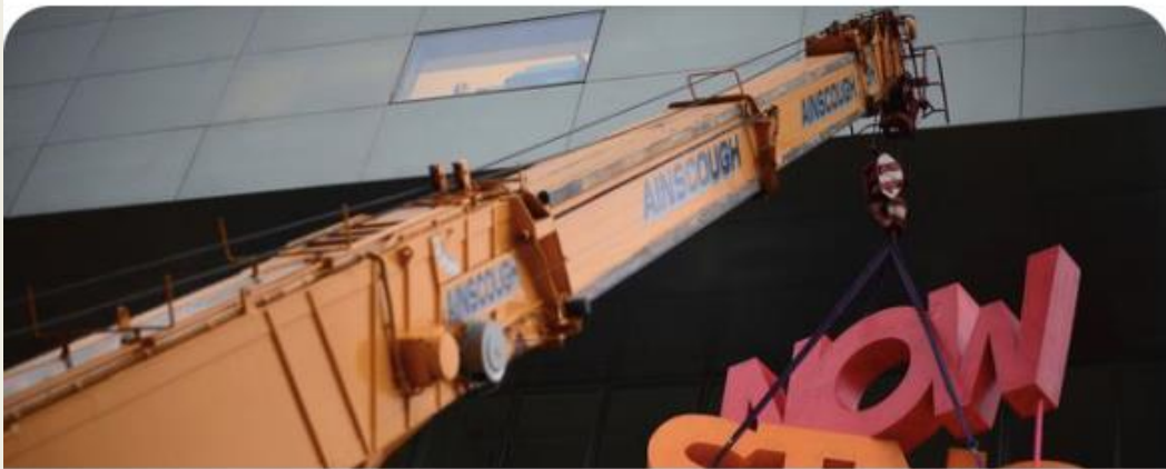
How dyslexia changes in other languages www.bbc.com