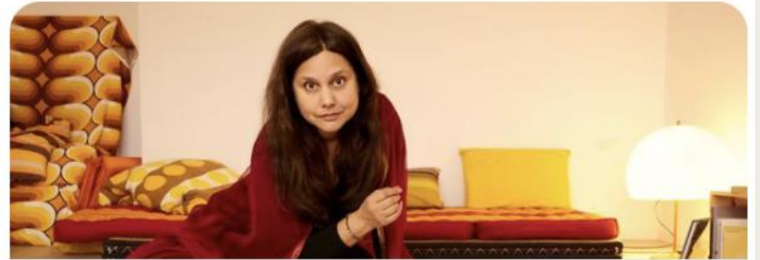
'I can't say my own name': The pain of language loss in families www.bbc.com